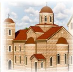
Building a new Monastery: come see our progress!

July 17 th - Saturday 9:00 am: Hours, Divine Liturgy